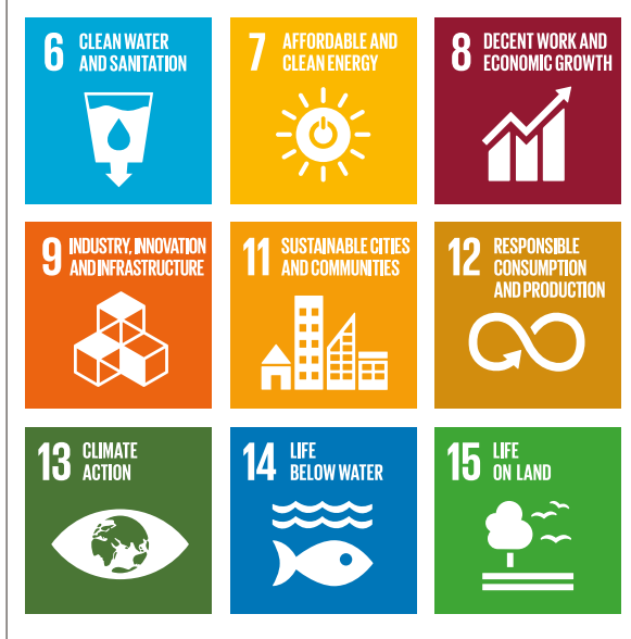
By reducing our carbon footprint, we are addressing nine of the United Nations' Sustainable Development Goals.

The Employer of Choice We are committed to being a great and happy place to work